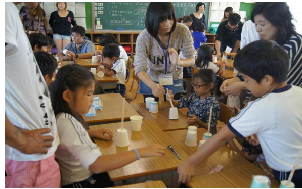
The third grader who makes a paper cup shooter Third grader: