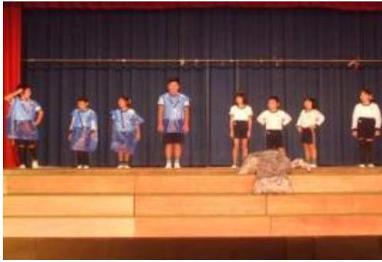
The children who announce having investigated about environment