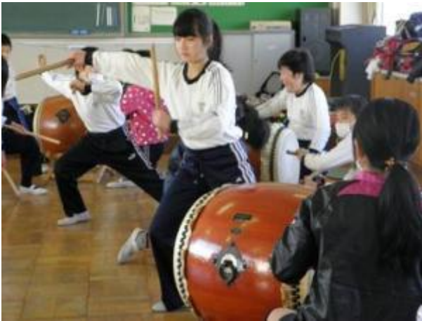
The children who strike a drum at the Japanese drum club

Club: Let's try to experience traditional culture.