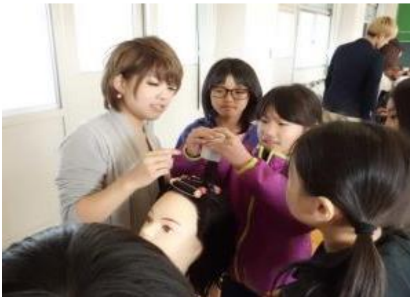
The children who are experiencing a beautician's work

the first grader: I will enjoy old play.