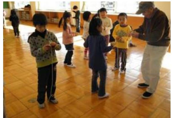
The children who ask him to teach a top belt