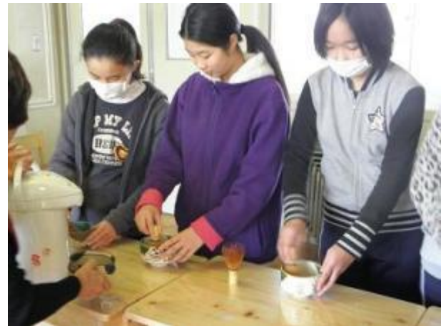
The children who make powdered green tea at tea club