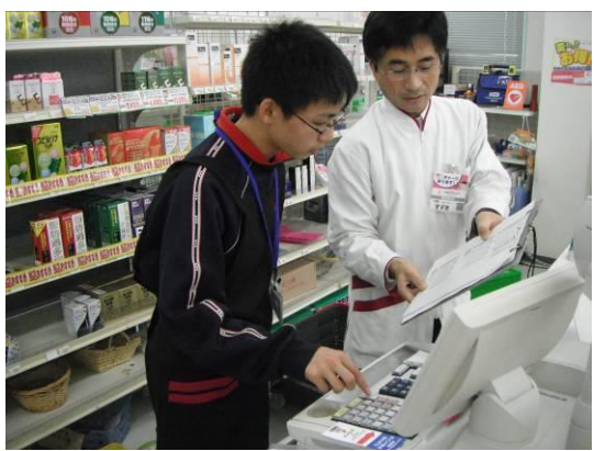
<Study of experience welfare (first-grade) >

<Study of experience occupation (second-grade)>