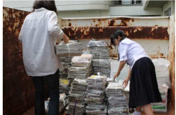
<Volunteers for clean-up 'Osoji-tai">