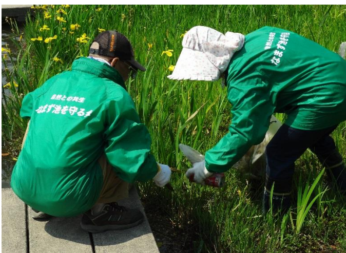
Students clean the lake with locals