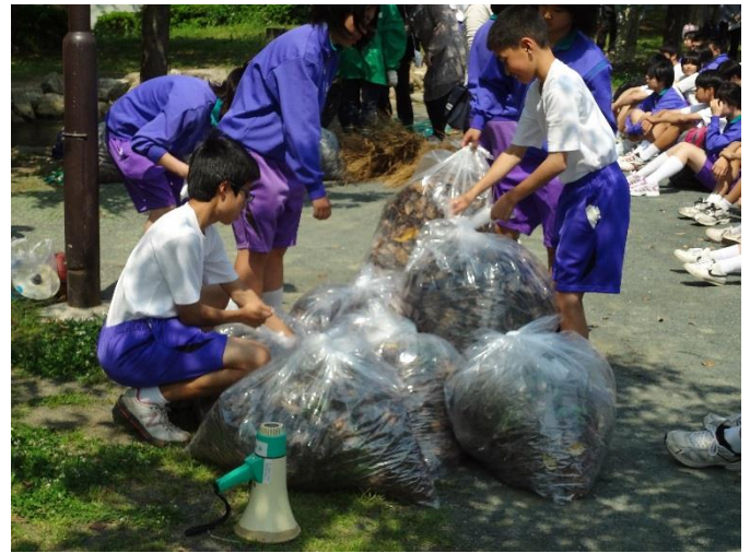
Students clean the lake and collect dead leaves or dead twigs.